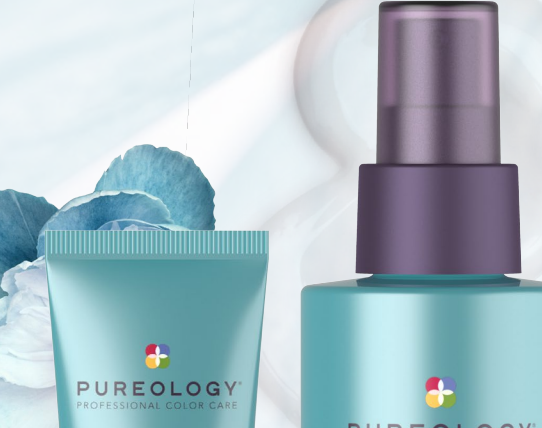
PUREOLOGY PROFESSIONAL COLOR CARE